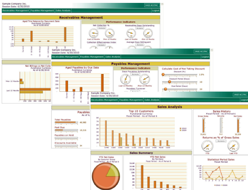
Accounts Payable, receivable and Sales Analysis dashboards